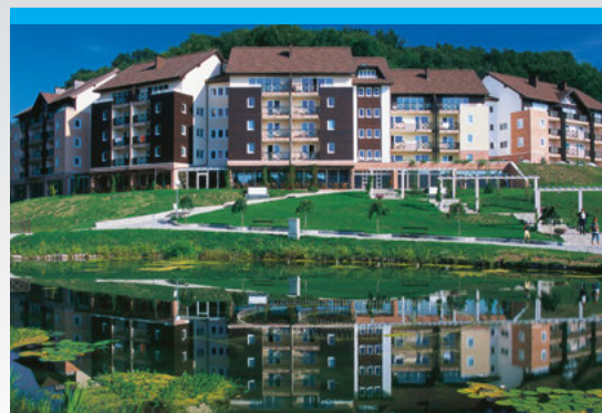
Nastanitev / Accommodation in Aparthotel Rosa****

3-5 posteljna soba Vključuje zajtrk in vstop v bazene v Wellness centru Termalija