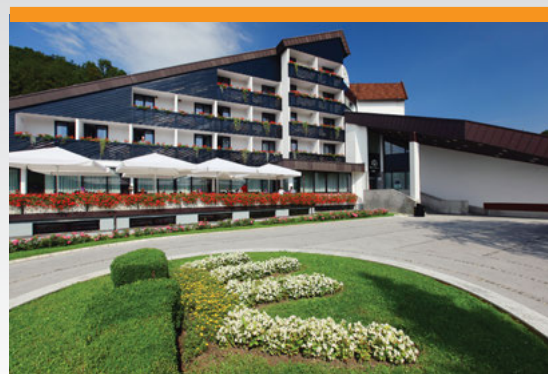
Nastanitev / Accommodation in hotel Breza****

Dvoposteljna soba Vključuje zajtrk in vstop v bazene v Wellness centru Termalija