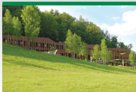
Nastanitev / Accommodation Wellness hotel Sotelia****superior

*** - Max. Number of rounds in one leg is 20